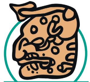
The Maya logogram for b'alam – jaguar

The Maya writing system, used to write several different Maya languages, was made up of over 800 symbols called glyphs. Some glyphs were logograms, representing a whole word, and some were syllabograms, representing units of sound. They were carved onto stone buildings and monuments and painted onto pottery. Maya scribes also wrote books, called codices , made from the bark of fig trees. Only priests and noblemen would know the whole written language.